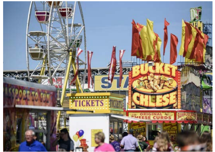
The Carnival at the South Dakota State Fair in Huron.